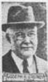
FOR MORE LIBERTY

Washington, Oct. 23.—(AP)— A group of men today agreed to give $700,000 to the Coolidge drive.