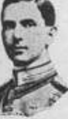
Victim of Fire

Attempt Made on Life of One-Master Picture Squad Includes Many New Talent Productions