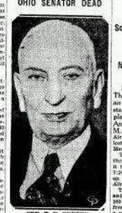
SEN. T. E. BURTON

The market was a dramatic one, with prices falling sharply in the last three minutes of trading.