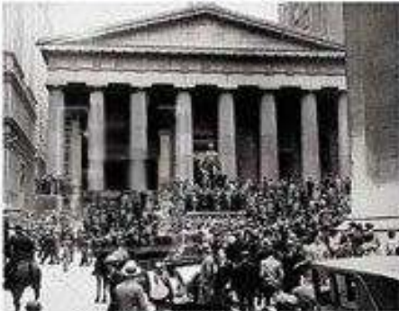
Panic in the streets in front of the New York Stock Exchange.

Large numbers of New York... The market falls in a panic. The market falls in a panic. The market falls in a panic.